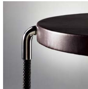
Stainless steel detailing contrasts with woven leather