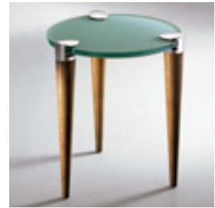
Round side table with Polished Stainless caps and painted glass top