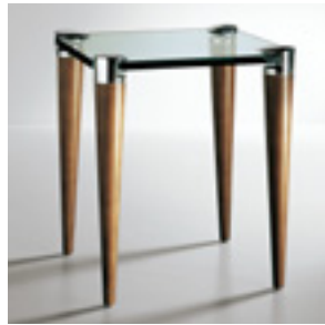
Square side table with clear glass top

Gracefully designed cast aluminum caps at the top of tapered maple legs provide a unique connection point for Pol tabletops, available in glass or stone. With their elegant design, these tables lend a contemporary appearance to a wide variety of environments.